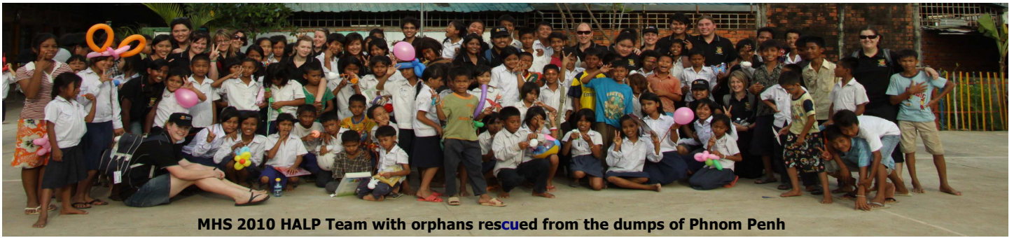
MHS 2010 HALP Team with orphans rescued from the dumps of Phnom Penh